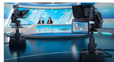
Image 2 - VPS's Robotic Camera systems